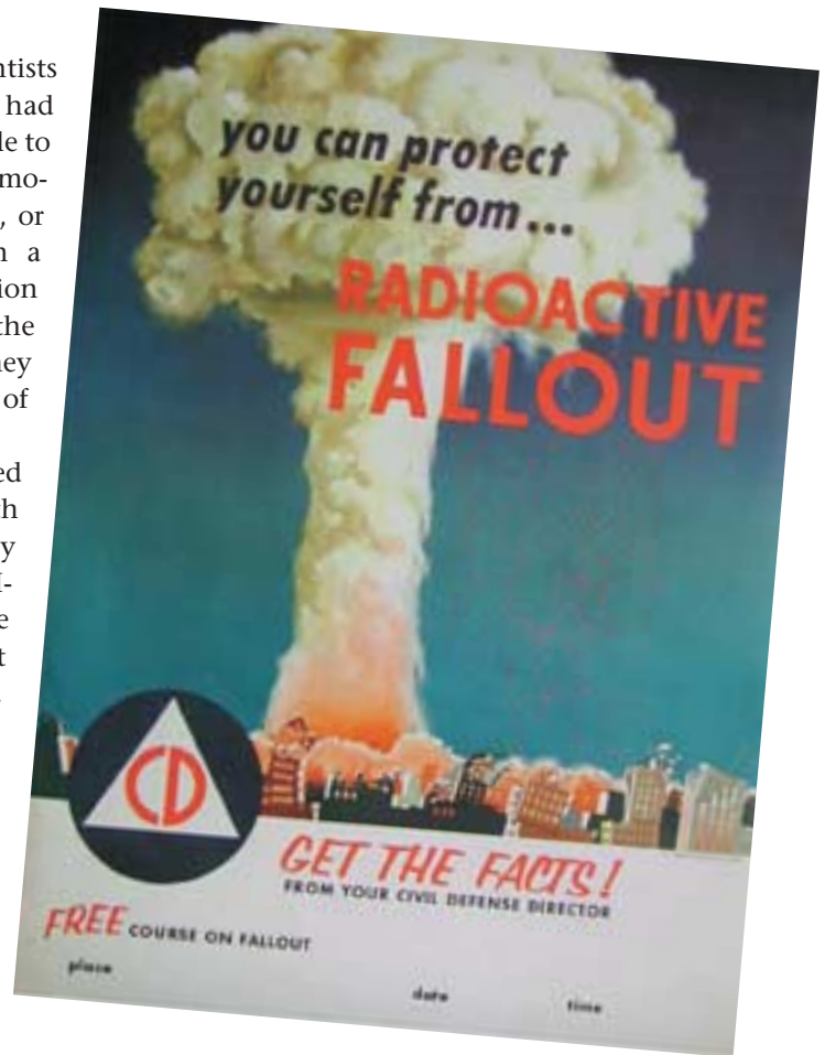
A A dramatic civil defense poster shows the fear of nuclear attack.

The threat of nuclear attack was unlike any the American people had ever faced. Even if only a few bombs reached their targets, millions of civilians would die. Schoolchildren like Annie Dillard practiced air-raid procedures, and some families built underground fallout shelters in their back yards. Fear of nuclear war became a constant in American life for the next 30 years.