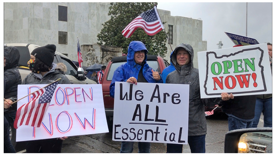
People at a Protest

People in many U.S. states are going to protests. The states include Michigan, Kentucky, California, Arizona and more. People at the protests want businesses to open. State governments had closed many businesses to help stop the spread of the coronavirus. When the businesses closed, many people across the U.S. lost their jobs. People at the protests want the governments to open businesses again. They think businesses can safely open, bringing back jobs while protecting employees and customers. Other people disagree. They think opening businesses is not safe yet. They think the coronavirus may spread and make many people sick. What do you think?