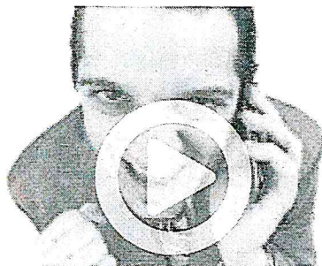
Free Funny Cell Phone Pictures

Students bringing a phone to school has both positive and negative consequences. Many schools have set rules in place regarding cell phones and whether they are permitted in the school or classroom. Parents can decide whether their child should bring a phone to school - as long as it is not against the rules - and set appropriate guidelines regarding the use of the phone.