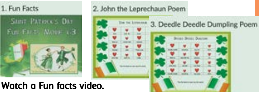
Learn a silly poem.