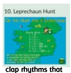
lead to a pot of gold!