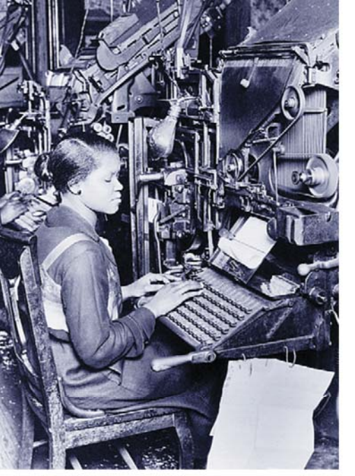
A young woman works as a typesetter in a publishing house in 1920.

NEW WORK OPPORTUNITIES Although women had worked successfully during the war, afterwards employers who believed that men had the responsibility to support their families financially often replaced female workers with men. Women continued to seek paid employment, but their opportunities changed. Many female college graduates turned to "women's professions" and became teachers, nurses, and librarians. Big businesses required extensive correspondence and record keeping, creating a huge demand for clerical workers such as typists, filing clerks, secretaries, stenographers, and office-machine operators. Others became clerks in stores or held jobs on assembly lines. A handful of women broke the old stereotypes by doing work once reserved for men, such as flying airplanes, driving taxis, and drilling oil wells.