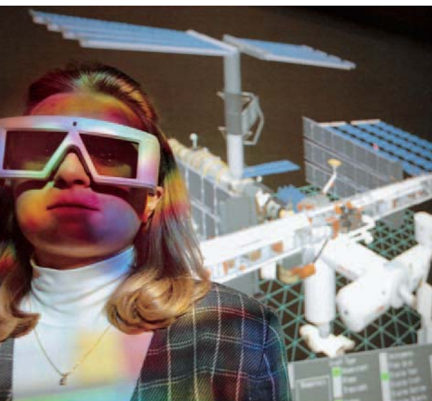
▲ At NASA Langley Research Center in Virginia, an aerospace engineer wearing stereo glasses sees a 3-D view of a space station simulation, as shown in the background.

The exciting growth in the telecommunications industry in the 1990s was matched by insights that revolutionized robotics, space exploration, and medicine. The world witnessed marvels that for many of the “baby boom generation,” people born in the late 1940s and the 1950s, echoed science fiction.