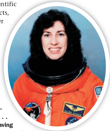
Dr. Ellen Ochoa

The International Space Station was established by joining and expanding upon the Russian station, Mir , and the American Spacelab .