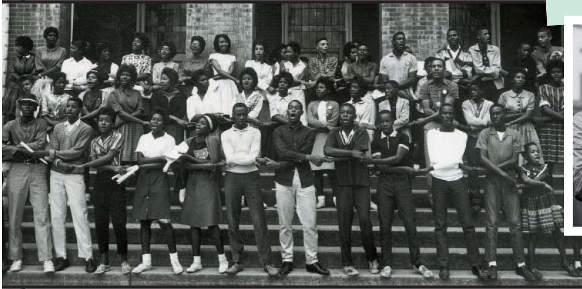
▲ Joined in harmony, African-American students in Selma, Alabama, gather on the steps of the Tabernacle Baptist Church to sing “We Shall Overcome.” (1963)

We shall overcome, We shall overcome, We shall overcome some day. (Chorus) Oh, deep in my heart I do believe: We shall overcome some day. We'll walk hand in hand. . . . We shall all be free. . . . We are not afraid. . . . We are not alone. . . . The whole wide world around. . . . We shall overcome. . . .