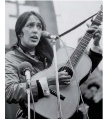
Joan Baez, 1965