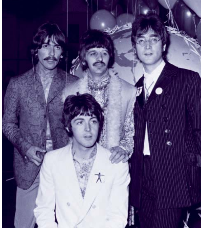
▲ The Beatles, shown here in 1967, influenced fashion with their long hair and psychedelic clothing.