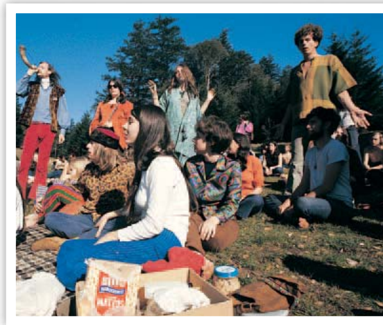
▲ Members of the counterculture relax in a California park.

Forman was part of the counterculture —a movement made up mostly of white, middle-class college youths disillusioned by the war in Vietnam and injustices in America during the 1960s. Instead of challenging the traditional system, they turned their backs on it and tried to establish a new one based on peace and love. Although their heyday was short-lived, their legacy remains.