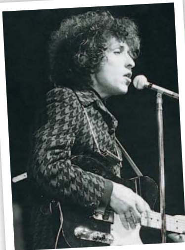
Bob Dylan, 1966 ▶