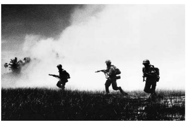
The swampy terrain of South Vietnam made for difficult and dangerous fighting. This 1961 photograph shows South Vietnamese Army troops in combat operations against Vietcong guerrillas.