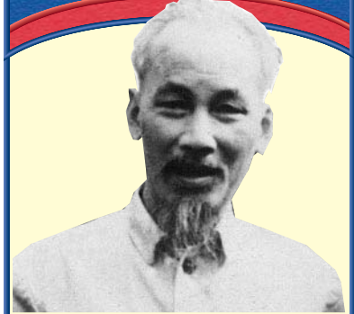
HO CHI MINH 1890–1969

Born Nguyen Tat Thanh to a poor Vietnamese family, Ho Chi Minh (which means "He Who Enlightens") found work as a cook on a French steamship. This allowed him to visit such cities as Boston and New York.