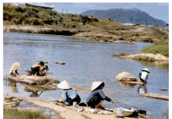
Rivers serve as places to bathe and wash clothing.