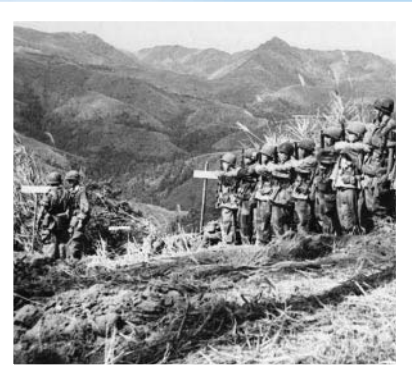
After parachuting into the mountains north of Dien Bien Phu, South Vietnamese troops await orders from French officers in 1953.