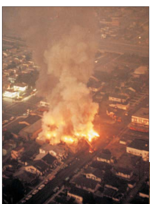
Between 1964 and 1968, more than 100 race riots erupted in major American cities. The worst included Watts in Los Angeles in 1965 ( top ) and Detroit in 1967 ( right ). In Detroit, 43 people were killed and property damage topped $40 million.

Comparing A How were civil rights problems in Northern cities similar to those in the South?