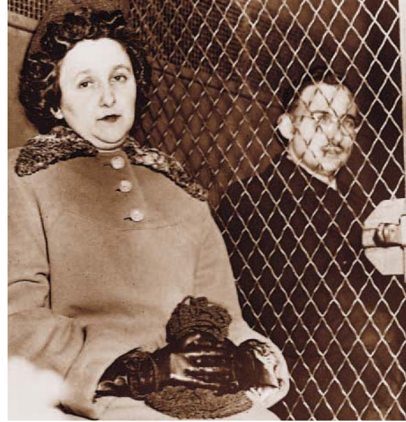
▲ Ethel and Julius Rosenberg were executed in June 1953 despite numerous pleas to spare their lives.

When asked if they were Communists, the Rosenbergs denied the charges against them and pleaded the Fifth Amendment, choosing not to incriminate themselves. They claimed they were being persecuted both for being Jewish and for holding radical beliefs. The Rosenbergs were found guilty of espionage and sentenced to death. In pronouncing their sentence, Judge Irving Kaufman declared their crime “worse than murder.” To him, they were directly responsible for one of the deadliest clashes of the Cold War. 🇨