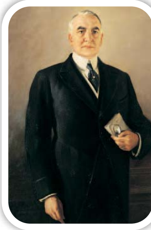
▲ Warren G. Harding, shown here in 1923, is considered one of the least successful presidents.

Despite Harding’s soothing speeches, his judgment turned out to be poor. The discord among the major world powers and the conduct within his own cabinet would test his politics and his character.