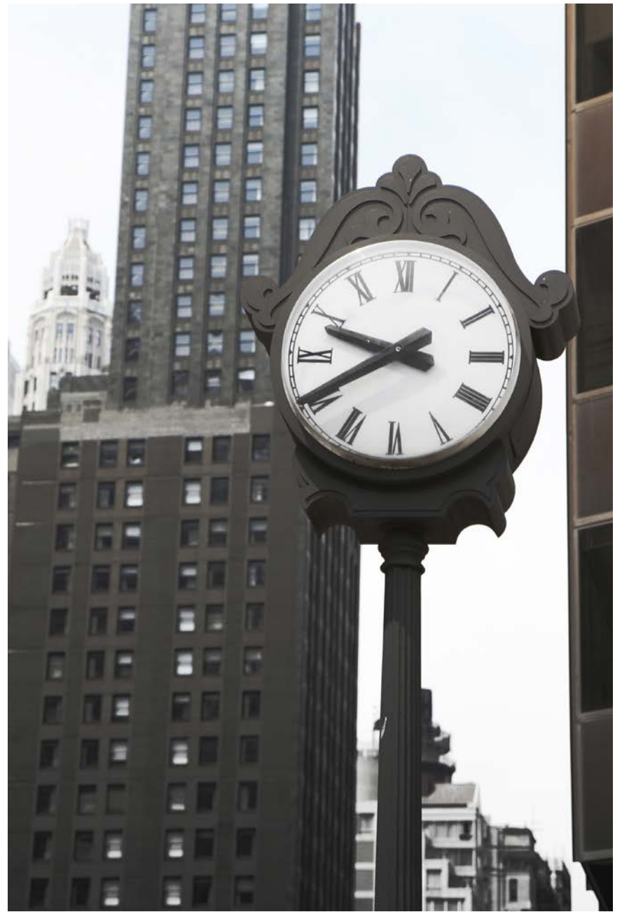
Here you see a circle.