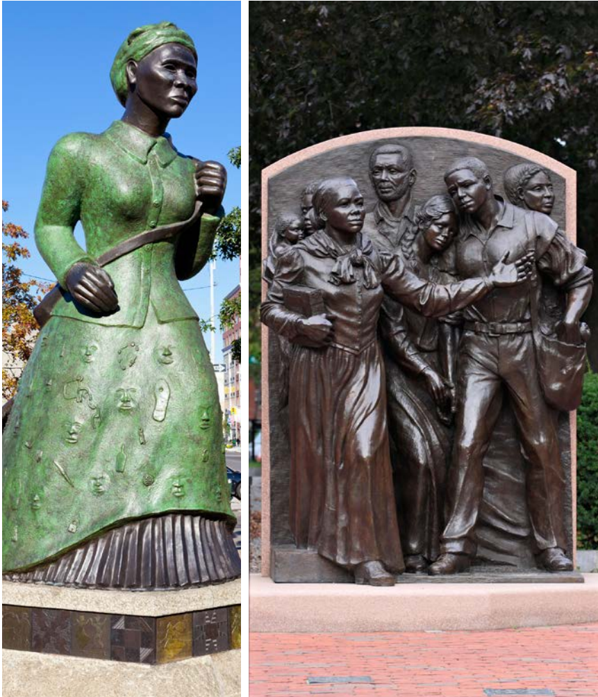
Famous statues of Harriet Tubman are in New York City, New York (left) and Boston, Massachusetts (right).

Harriet Tubman was a hero. Harriet Tubman helped many slaves become free.