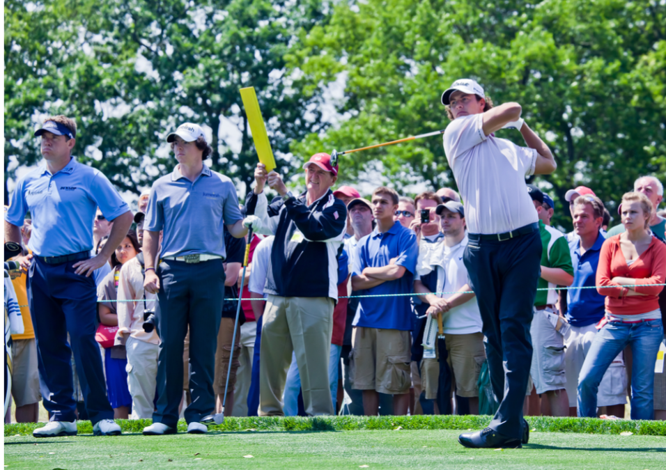
A Professional Golfer

The U.S. Open started on September 17, in Mamaroneck, New York.