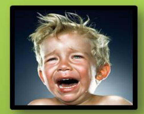
What my mom thinks I do