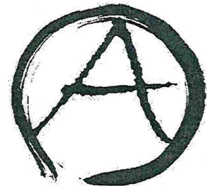
An A inside a circle is the traditional symbol for anarchy.

In an anarchy , nobody is in control—or everyone is, depending on how you look at it. Sometimes the word anarchy is used to refer to an out-of-control mob. When it comes to government, anarchy would be one way to describe the human state of existence before any governments developed. It would be similar to the way animals live in the wild, with everyone looking out for themselves. Today, people who call themselves anarchists usually believe that people should be allowed to freely associate together without being subject to any nation or government. There are no countries that have anarchy as their form of government.