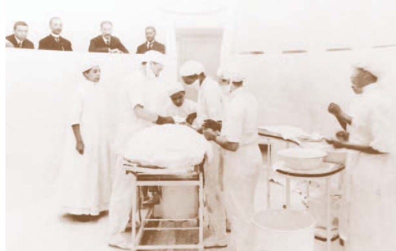
▲ Medical students and their professors work in the operating theater of the Moorland-Spingarn Research Center at Howard University.

By the turn of the 20th century, millions of people received the education they needed to cope with a rapidly changing world. At the same time, however, racial discrimination remained a thorn in the flesh of American society.