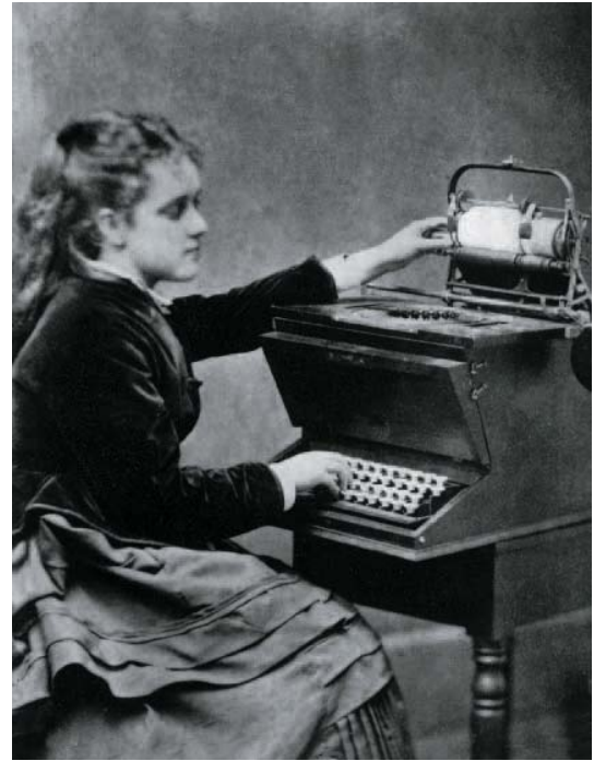
▲ The typewriter shown here dates from around 1890.

Industrialization freed some factory workers from backbreaking labor and helped improve workers' standard of living. By 1890, the average workweek had been reduced by about ten hours. However, many laborers felt that the mechanization of so many tasks reduced human workers' worth. As consumers, though, workers regained some of their lost power in the marketplace. The country's expanding urban population provided a vast potential market for the new inventions and products of the late 1800s.