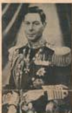
HIS MAJESTY THE KING

FRANCE WILL FIGHT TOO, CHAMBERLAIN TELLS EMPIRE