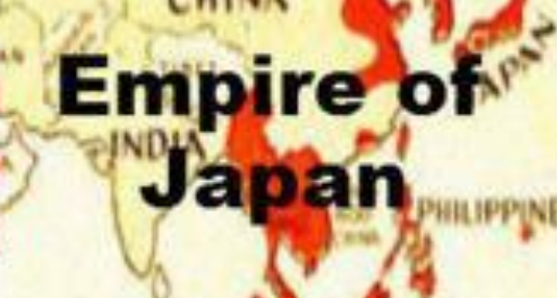
Empire of Japan