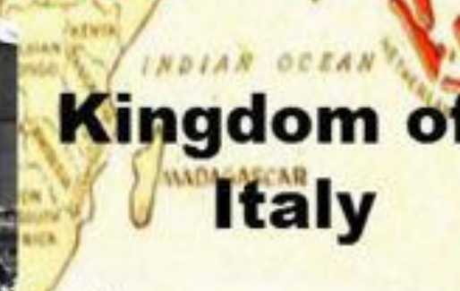
Kingdom of Italy