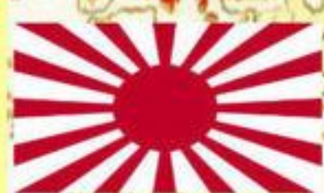
Rising sun flag