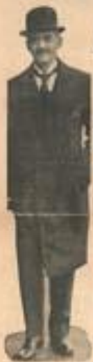
Mr. Neville Chamberlain