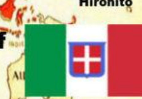
Flag of Italy