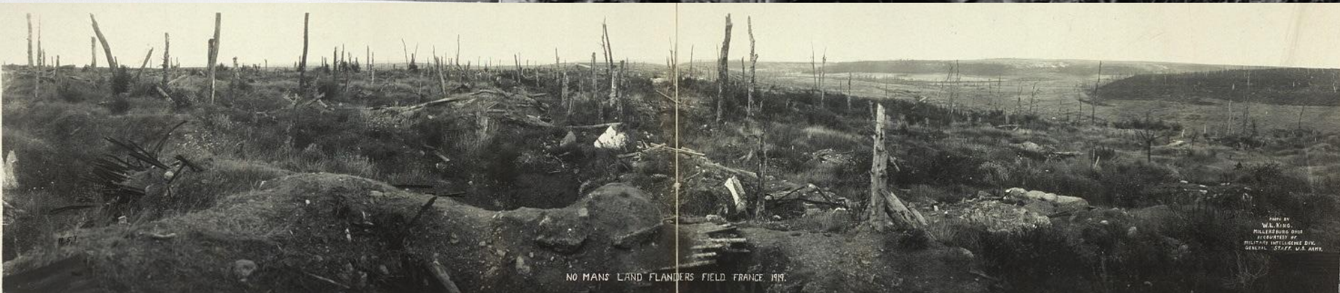
NO MAN'S LAND FLANDERS FIELD FRANCE 1919.