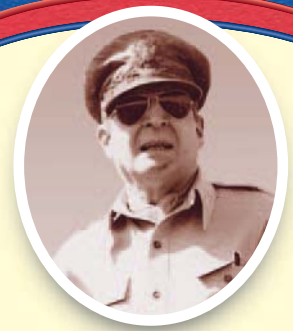
DOUGLAS MACARTHUR 1880–1964

Douglas MacArthur was too arrogant and prickly to be considered a “regular guy” by his troops. But he was arguably the most brilliant Allied strategist of World War II. For every American soldier killed in his campaigns, the Japanese lost ten.