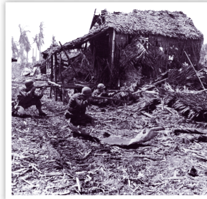
▲ American soldiers on Leyte in the Philippine Islands in late 1944.

—from Goodbye Darkness: A Memoir of the Pacific War