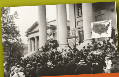
MOVEMENT FOR ELECTION REFORM