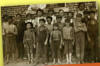
SOCIAL WELFARE REFORM