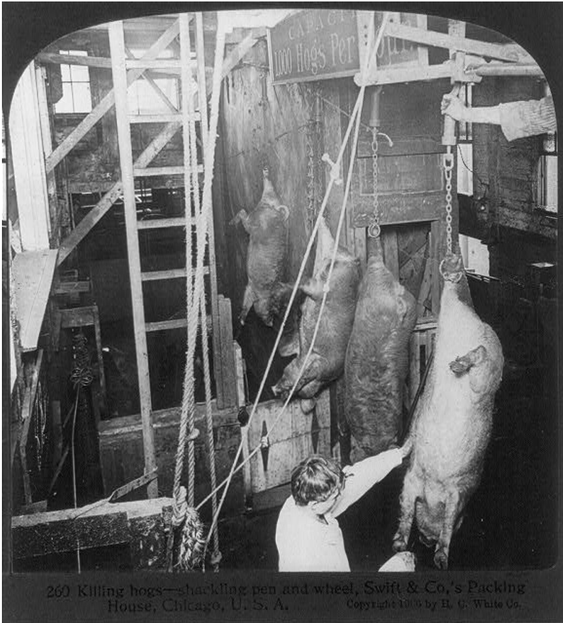
Killing hogs, Swift & Co.'s Packing House, Chicago, U.S.A.