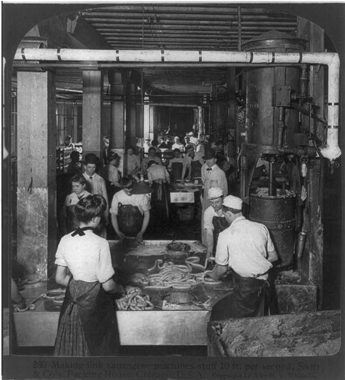
Making link sausages, Swift & Co.'s Packing House, Chicago, U.S.A.

9. What condition does the packing plant seem to be in?