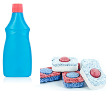
DISHWASHER DETERGENT / PODS