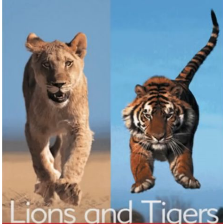
Lions and Tigers