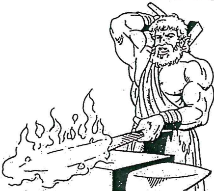
10 Hephaestus god of blacksmiths, metalworkers, and craftsmen

Hephaestus was the son of Zeus and Hera. The forge and anvil (metalworking tools) were his symbols. His favorite bird was the quail.