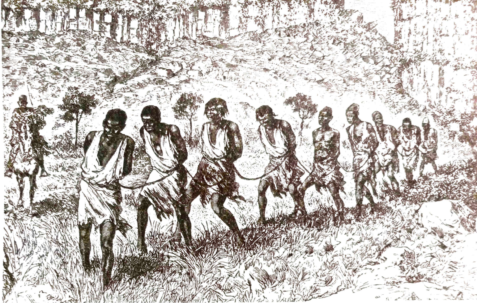
A group of captured West Africans are marched away from their village.