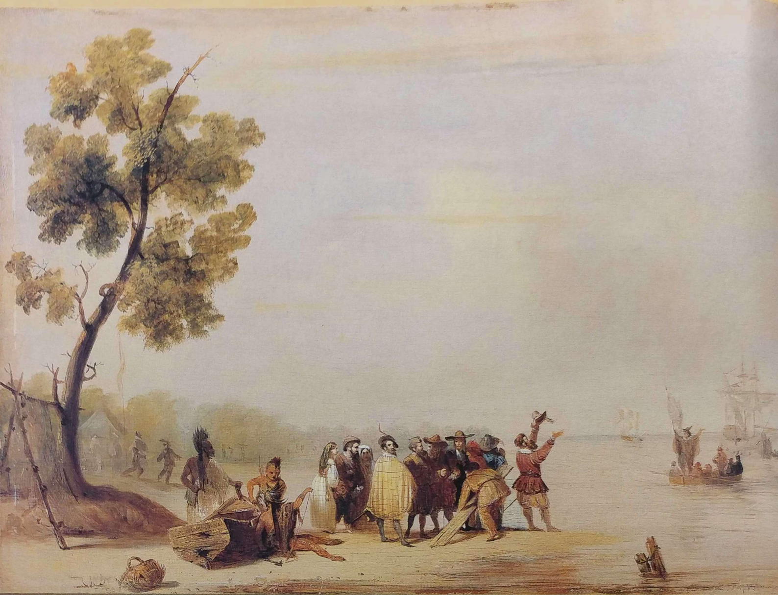
John Gadsby Chapman, Good Times in the New World (The Hope of Jamestown) , 1841, Oil on panel, 7 7/8" H x 11 1/2" W. Virginia Museum of Fine Arts, Richmond. The Paul Mellon Collection.