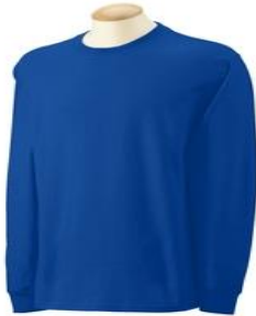
Royal Long Sleeve