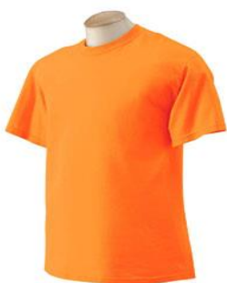
Safety (Bright) Orange