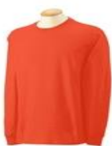
Orange Long Sleeve