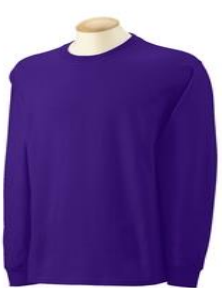
Purple Long Sleeve