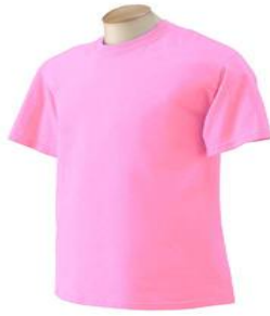
Safety (Bright) Pink