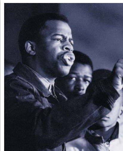
▲ John Lewis

These violent deaths were but two of the traumatic events that rocked the nation in 1968. From a shocking setback in Vietnam to a chaotic Democratic National Convention in Chicago, the events of 1968 made it the most tumultuous year of a turbulent decade.