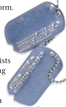
▲ First used in World War I, dog tags were stamped with personal identification information and worn by U.S. military personnel.

By 1967, Americans were evenly split over supporting and opposing the war. However, a small force outside of mainstream America, mainly from the ranks of the nation's youth, already had begun actively protesting the war. Their voices would grow louder and capture the attention of the entire nation.