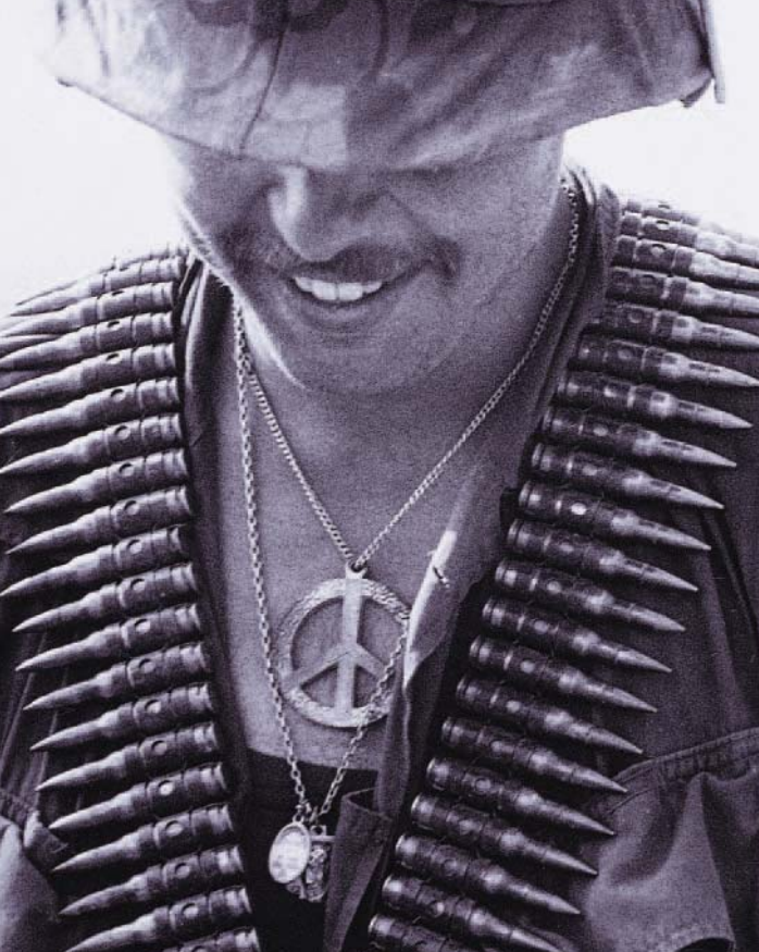
▲ A soldier with the 61st Infantry Division wears symbols of both war and peace on his chest.

SINKING MORALE The frustrations of guerrilla warfare, the brutal jungle conditions, and the failure to make substantial headway against the enemy took their toll on the U.S. troops' morale. Philip Caputo, a marine lieutenant in Vietnam who later wrote several books about the war, summarized the soldiers' growing disillusionment: "When we marched into the rice paddies . . . we carried, along with our packs and rifles, the implicit convictions that the Vietcong could be quickly beaten. We kept the packs and rifles; the convictions, we lost."