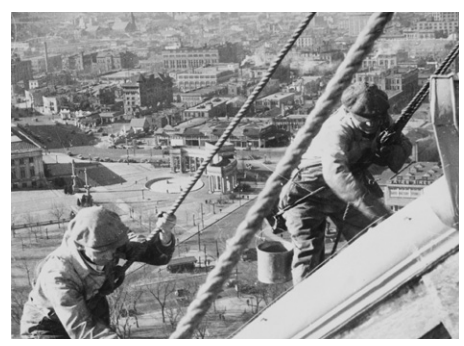
Workers hired by the temporary Civil Works Administration (CWA) paint the gold dome of the Colorado State Capitol in Denver, 1934. The CWA's success at putting Americans to work inspired the New Deal's largest single endeavor, the Works Progress Administration, which employed millions of Americans in jobs that ranged from building roads to teaching impoverished adults to read and write.

The New Deal left the country far better equipped to face the next calamity–World War II–and set the stage for the G.I. Bill, a tide of postwar prosperity, and the broadest middle class the world had ever seen.