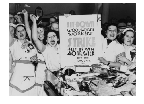
Woolworth's workers strike for a forty-hour week, 1937. Despite setbacks for the New Deal in 1937, in 1938 Franklin D. Roosevelt's administration achieved the long-sought goal of passing the Fair Labor Standards Act, which set a federal minimum wage and maximum workweek and imposed the first federal ban on child labor.