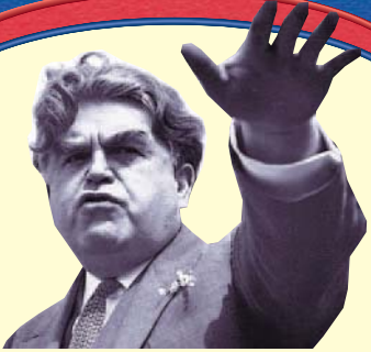
JOHN LLEWELLYN LEWIS 1880–1969

John L. Lewis was born in the little mining town of Lucas, Iowa. His family had traditionally been concerned with labor rights and benefits.