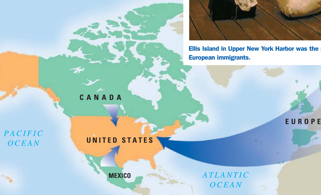
Immigration to the United States, 1921 and 1929