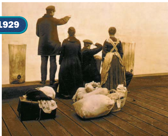
Ellis Island in Upper New York Harbor was the port of entry for most European immigrants.

The map and graph below show the change in immigration patterns resulting from the Emergency Quota Act, among other factors. Hundreds of thousands of people were affected. For example, while the number of immigrants from Mexico rose from 30,758 in 1921 to 40,154 in 1929, the number of Italian immigrants dropped drastically from 222,260 in 1921 to 18,008 in 1929.