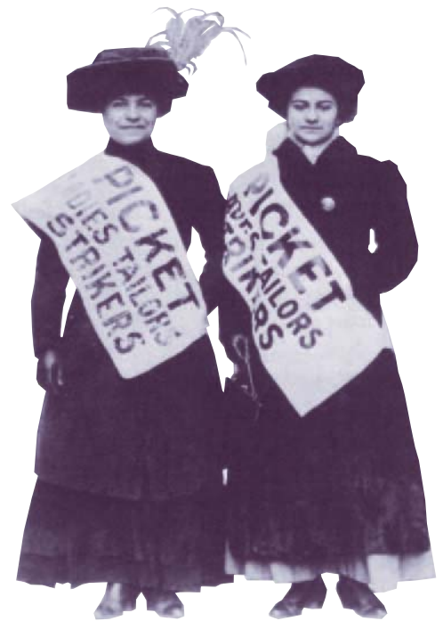
▲ Strikers included working women tailors who fought for improved working conditions.

The steel strike ended in January 1920. In 1923, a report on the harsh working conditions in steel mills shocked the public. The steel companies agreed to an eight-hour day, but the steelworkers remained without a union. E