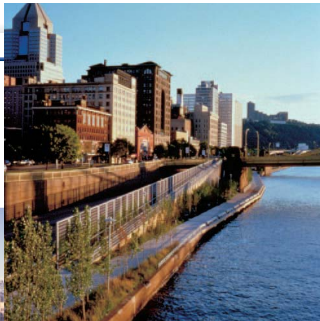
▲ Allegheny Riverfront Park in 1999