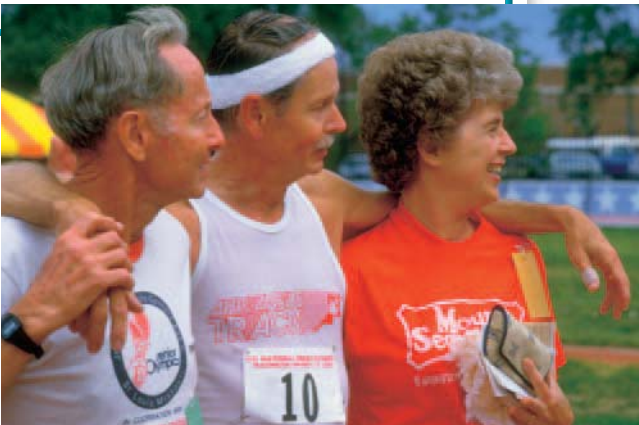
Senior athletes compete at the first U.S. National Senior Olympics held in St. Louis, Missouri, in 2000.