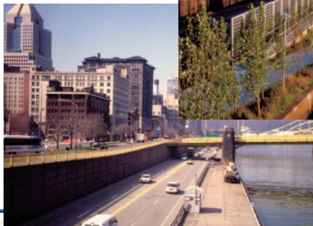
◀ The Allegheny River waterfront in 1984