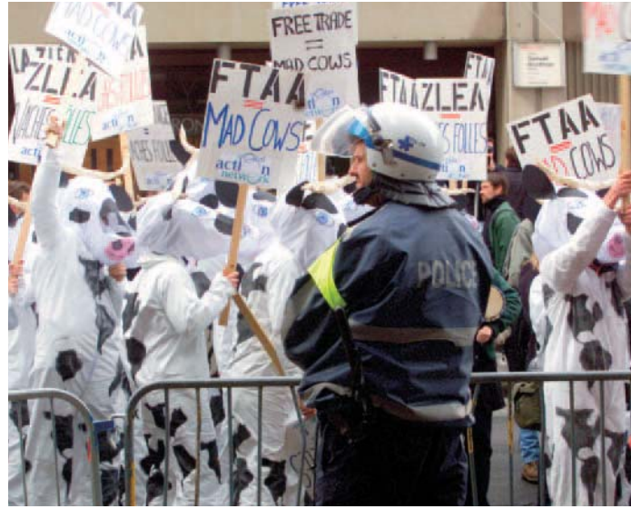
▲ In Montreal, Canada, on March 29, 2001, protesters demonstrate at a summit on globalization and the Free Trade Area of the Americas (FTAA).

In the 1990s, U.S. businesses frequently moved their operations to less economically advanced countries, such as Mexico, where wages were lower. After the passage of NAFTA, more than 100,000 low-wage jobs were lost in U.S. manufacturing industries such as apparel, auto parts, and electronics. Also, competition with foreign companies caused many U.S. companies to maintain low wages. C