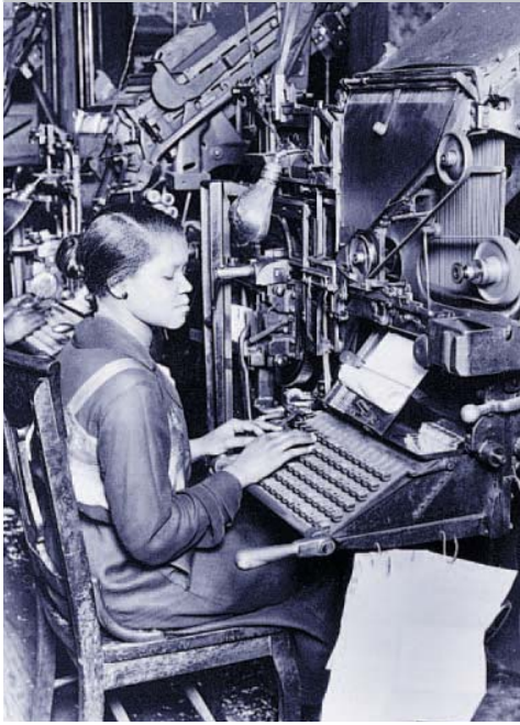
▲ A young woman works as a typesetter in a publishing house in 1920.

NEW WORK OPPORTUNITIES Although women had worked successfully during the war, afterwards employers who believed that men had the responsibility to support their families financially often replaced female workers with men. Women continued to seek paid employment, but their opportunities changed. Many female college graduates turned to “women’s professions” and became teachers, nurses, and librarians. Big businesses required extensive correspondence and record keeping, creating a huge demand for clerical workers such as typists, filing clerks, secretaries, stenographers, and office-machine operators. Others became clerks in stores or held jobs on assembly lines. A handful of women broke the old stereotypes by doing work once reserved for men, such as flying airplanes, driving taxis, and drilling oil wells. B