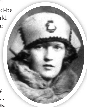
Zelda Sayre Fitzgerald

“Rouge means that women want to choose their man—not take what lives in the next house. . . . Look back over the pages of history and see how the loveliness of women has always stirred men—and nations—on to great achievement! There have been women who were not pretty, who have swayed hearts and empires, but these women . . . did not disdain that thing for which paint and powder stands. They wanted to choose their destinies—to be successful competitors in the great game of life.”