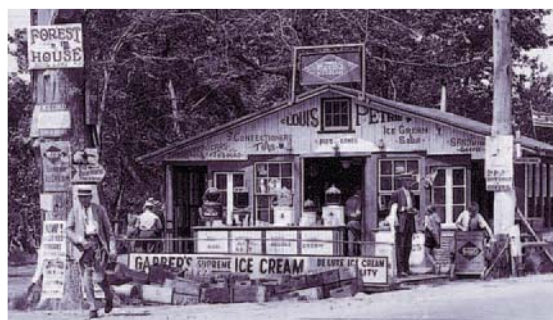
Roadside stands offering food, drink, and other items appeared in increasing numbers.

The “Auto Camp” developed as townspeople roped off spaces alongside the road where travelers could sleep at night.