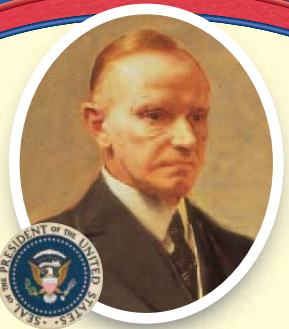
CALVIN COOLIDGE 1872–1933

Stepping into office in 1923, the tightlipped Vermonter was respected for his solemnity and wisdom. Coolidge supported American business and favored what he called “a constructive economy.”