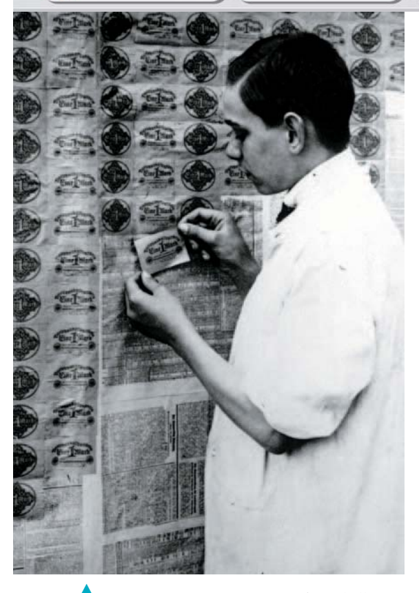
In 1923, a German man papers his walls with money made nearly worthless by high inflation following World War I.

countries signed the Kellogg-Briand Pact, which renounced war as a national policy. However, the pact was futile, as it provided no means of enforcement.