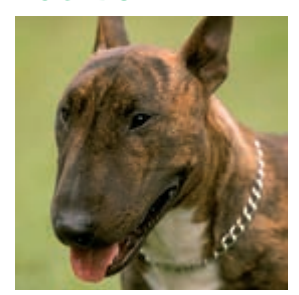
brindled (brĭn'dld): adj . light brownish yellow or grayish with streaks or spots of a darker color